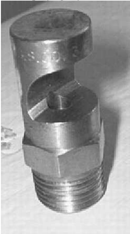
Floodjet SS3/8k-45 nozzle.

The basis for boom length tests and drop-size tests is the nozzle. The Floodjet SS3/8k-