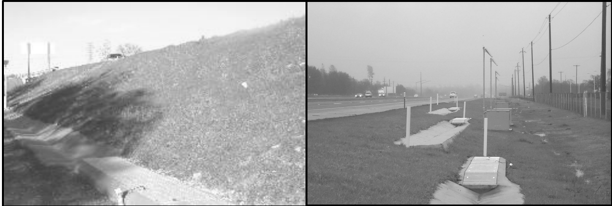
Figure 2. Cottonwood and Redding Test Sites.

The CHD Study utilizes automatic water quality sampling equipment that can be controlled remotely. The sampling equipment measures the storm water runoff flow captured in each collection trench. A 60-degree trapezoidal flume, with a depth-measuring device, is located at the end of each collection trench. One monitoring station is placed at each collection trench. A monitoring station contains a data logger and control module; a flow meter; an automated peristaltic sampler; a cellular modem; interface electronics; power supply; and a tipping bucket rain gauge. The sampling equipment creates composite samples of storm water runoff in a flow-proportioned manner. The concentrations of constituents in these composite samples represent the “event mean concentrations” for the storm event sampled. The minimum constituent list for water quality monitoring included conventionals (e.g., TSS, conductivity, pH), nutrients (e.g., TKN, total phosphorus), and total and dissolved metals (e.g., copper, lead, and zinc), as detailed in the Caltrans Guidance Manual: Storm Water Monitoring Protocols (Caltrans, 2000).