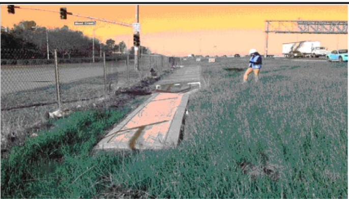
Figure 2. Rain covers.

preceded by a 10 ft approach section of concrete. Empirical observations were also made regarding site condition, erosion, gopher disturbance, sediment accumulation, and site damage.